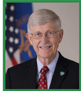
Francis S. Collins, M.D., Ph.D.

In 2015, the Sexual & Gender Minority Research Office (SGMRO) was established to expand the National Institutes of Health (NIH) research activities in sexual and gender minority (SGM) populations, remove related systemic barriers, encourage a robust and engaged SGM research workforce, and evaluate progress made on the goals of the NIH FY 2016–2020 Strategic Plan to Advance Research on the Health and Well-being of Sexual and Gender Minorities . Since its inception, the SGMRO has worked diligently with NIH's Institutes, Centers, and Offices to pursue the goals of this plan.